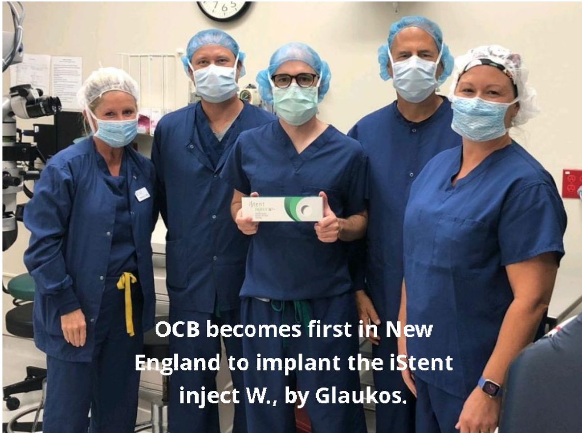
OCB becomes first in New England to implant the iStent inject W., by Glaukos.